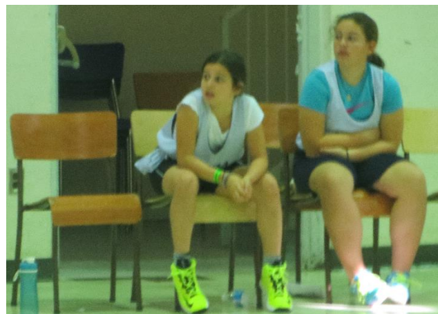
(Seen here ere the AHEPA Toronto Junior Girls)